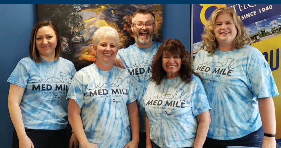
Telcomm Credit Union Team for Medical Mile and 5K Run/Walk